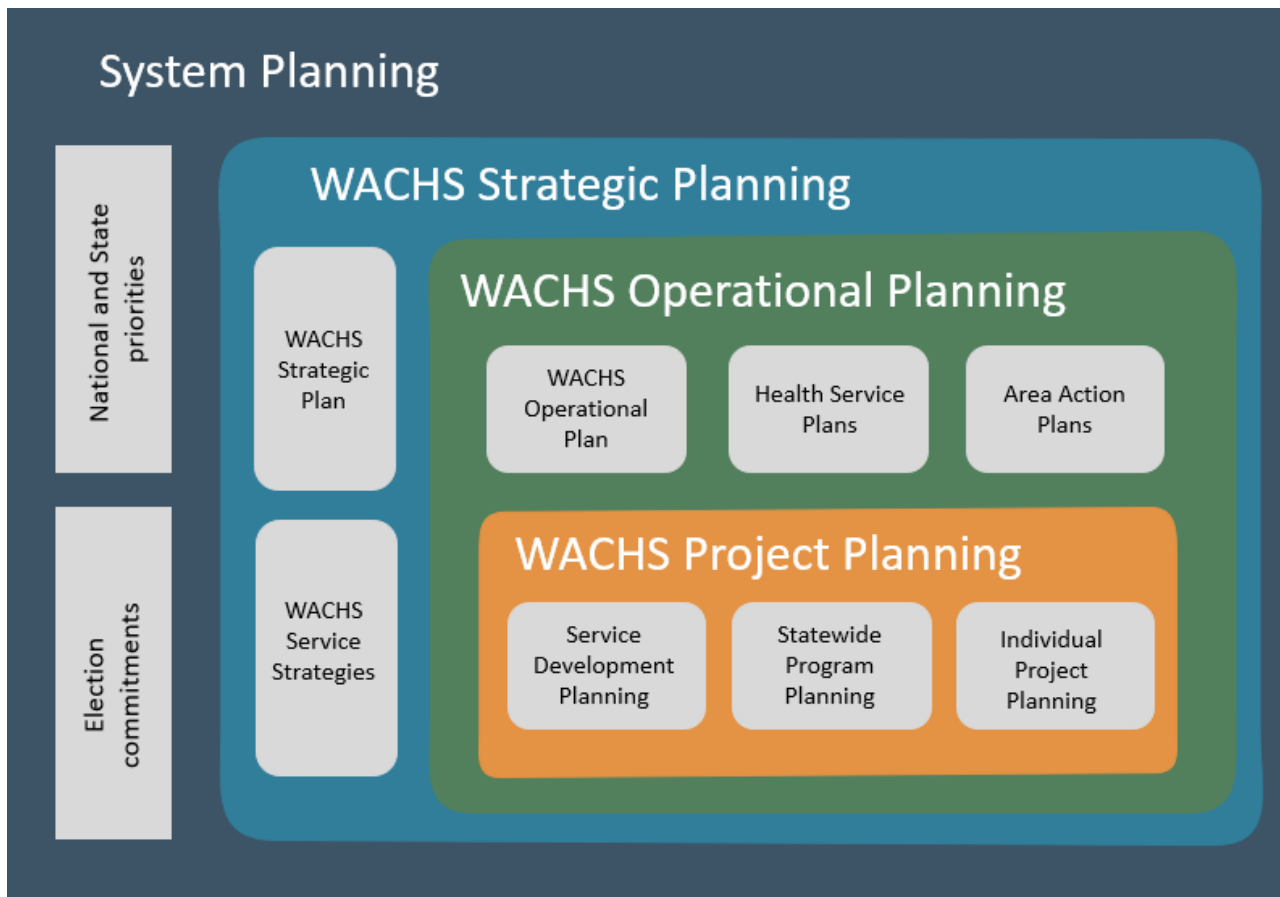
Figure 1: The WACHS Planning and Funding Landscape

The focus of all levels of planning and evaluation is to improve access to culturally responsive, patient-centred integrated care, and improve the patient/carer health journey, experience, and outcomes. This policy recognises the WA Sustainable Health Review 2019 (SHR) and the WA Clinical Services Framework (CSF) as key overarching health service planning documents. It identifies that planning is complex, multi-dimensional and dynamic and takes place within a broader landscape ( Figure 1 ).