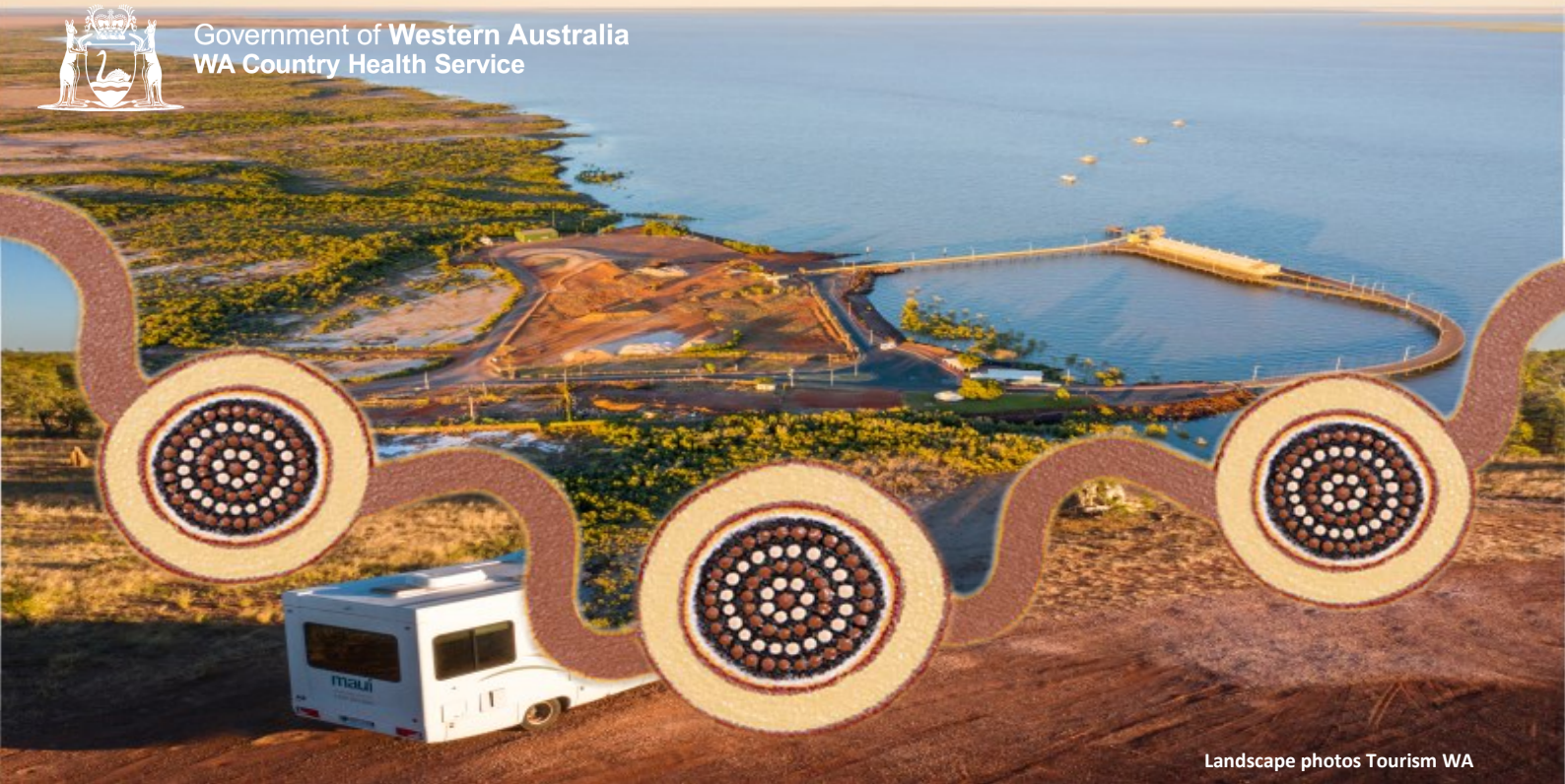
Landscape photos Tourism WA